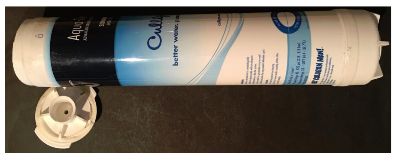
Figure 1. Water filter as received.

A photograph of the failed water filter is shown in (Figure 1). A molding void defect was visible in the fracture surface (Figure 2).