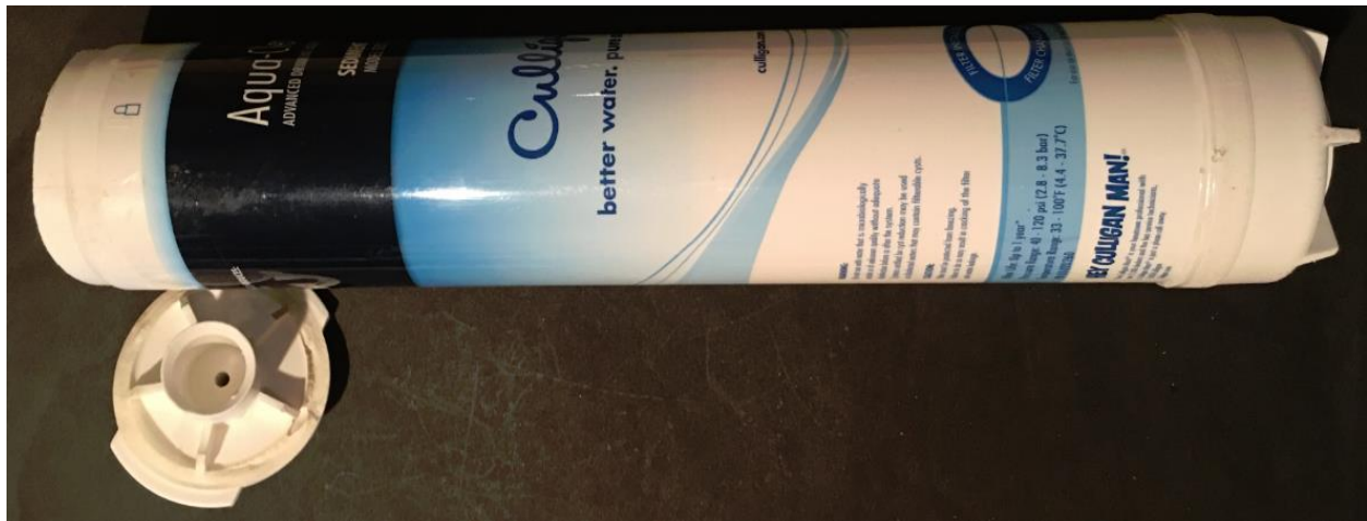
Figure 1. Water filter as received.

A photograph of the failed water filter is shown in (Figure 1). A molding void defect was visible in the fracture surface (Figure 2).